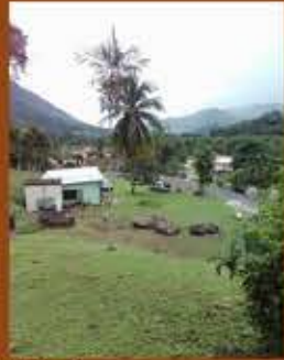
VIEW - 3