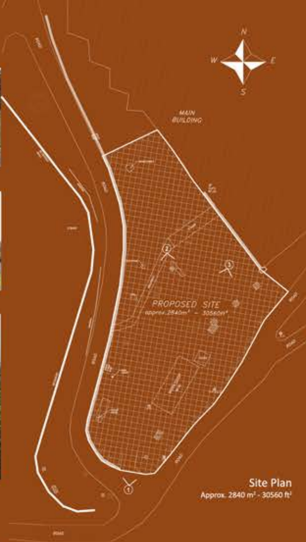
Site Plan Approx. 2840 m 2 - 30560 ft 2