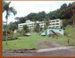
VIEW - 1