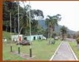
VIEW - 2