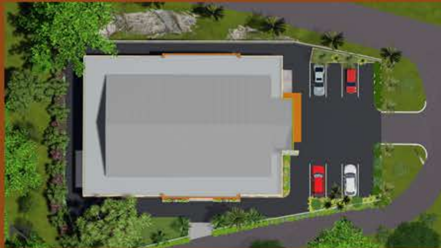
Aerial View of Site Layout